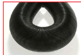
APK marine hot air ducting